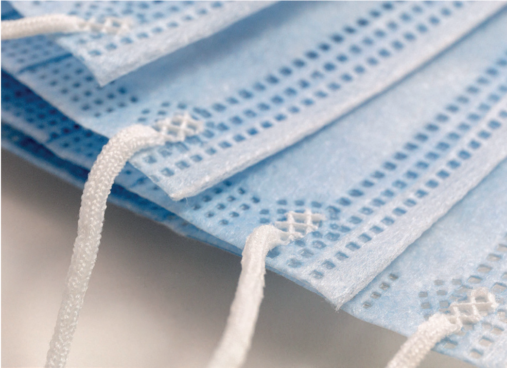
Caption: Detailed view of the mouth and nose protection masks manufactured with ultrasound