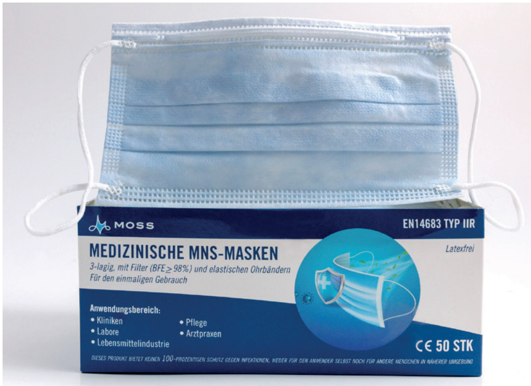
Caption: Mouth and nose protection masks certified according to DIN EN 14683 and ASTM F2100 produced fully automatically with ultrasonic systems.