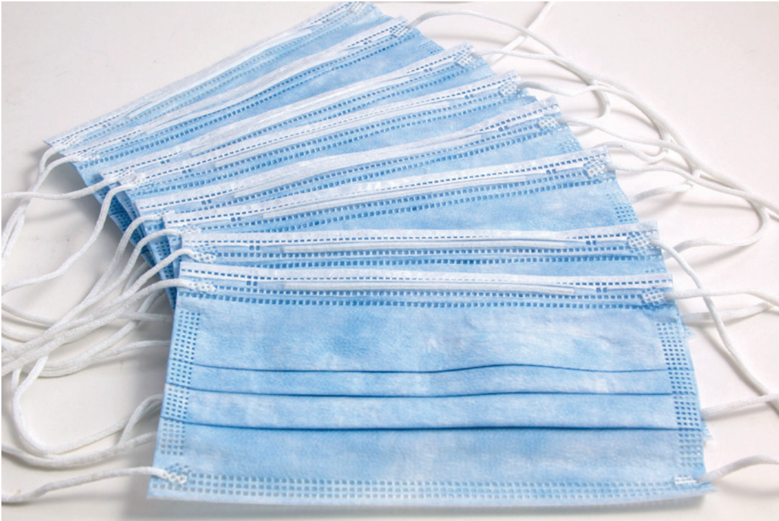
Caption: Mouth and nose protection masks produced with ultrasound