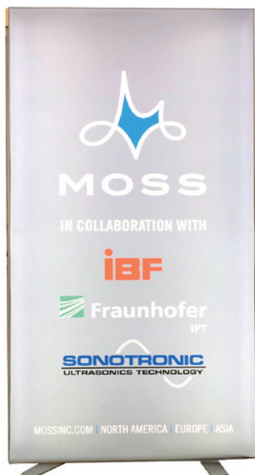
Caption: The four cooperation partners for the serial production of MNS