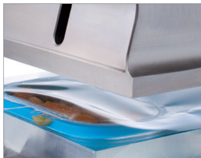
Sealing a tray in contact with product

For format-dependent packaging solutions with ultrasound, we not only adjust the parts nest tools to the packed goods but also the sonotrodes themselves. Depending on the application, sealing and punching tasks are also combined in this case.