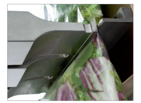
Ultrasonic sealing system for tubular bags

Production faults are drastically reduced with the use of ultrasound, because the contents themselves are not heated. Also, the contents to be found in the seal area are separated by the ultrasonic effect during the sealing process. The quality of the seam produced and the barrier layers of the bag film are not affected.