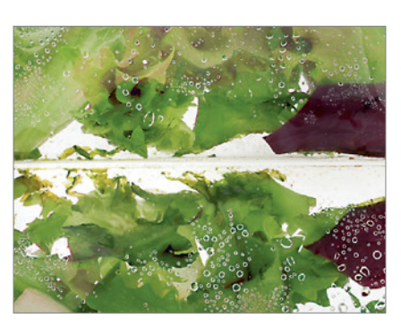
Sealing through contaminated areas