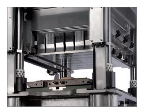
Sonotrode table with flat sealing area

For format-dependent packaging solutions with ultrasound, we not only adjust the parts nest tools to the packed goods but also the sonotrodes themselves. Depending on the application, sealing and punching tasks are also combined in this case.